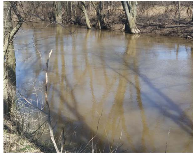
Figure 4. Crockery Creek, Ensley Road site (Station 8). Photo on left is from August 2009 and photo on right is from March 2016.

At Station 14 the macroinvertebrate community scored acceptable (1; Table 4) and habitat scored good (145; Table 6). The macroinvertebrate community was largely dominated by Amphipoda. Two Ephemeroptera, one Trichoptera, and one Plecoptera family were also collected, indicating intermediate disturbance at this site. The stream was sinuous; however, there were signs of flashiness such as bank scour and heavy sediment deposition. The stream bed was largely sand. The riparian areas were largely intact with large trees that provided plenty of canopy cover. Further upstream from where we sampled is a cattle pasture that is near the stream. Aerial photos revealed one area where cattle may be accessing the stream and should be investigated with a site visit later. Grand Rapids district staff have been notified of potential unrestricted cattle access near this site. The larger surrounding area consists of a mix of agricultural and forest land use.