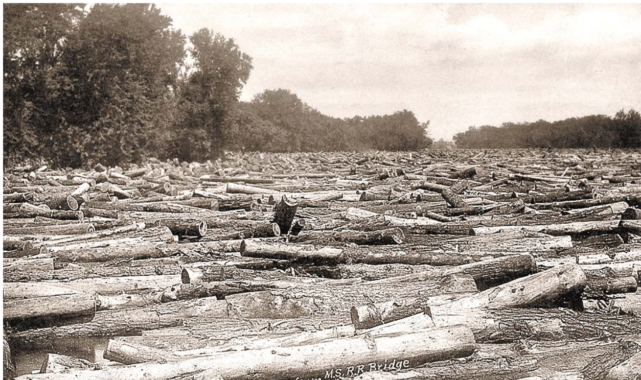
Figure 2. Portion of massive log jam in Grand River that occurred in 1883.

through the city of Grand Rapids: The Sixth Street Dam and the beautification dam set. Construction of the Sixth Street Dam began in 1849, with the placement of rocks, logs, and brush in the channel. The final structure was completed in 1866. The Sixth Street Dam was originally used to divert impounded water to canals to the east and west of the river that powered sawmills. The dam is now classified as a retired hydroelectric dam and maintains about eight feet of hydrologic head (Figure 3). The beautification dam, which is actually a set of 4 separate structures located in close proximity to each other, was constructed in 1931. The beautification dam structures only serve aesthetic purposes (Hanshue and Harrington, 2011). The impacts of low-head dams in general, such as flow and sediment transport disruption, increased downstream scouring, impoundment temperature increases, increased evaporative water loss from the impoundment, changes in macroinvertebrate communities, and fragmentation of fish communities are well documented (e.g., Allan, 1995). In the Grand River, construction of the dam in Lyons (just upstream of the Lower Grand River study area) had detrimental impacts on native mussel populations (van der Schalie, 1948). Hanshue and Harrington (2011) noted that the beautification dam structures may impede native fish movement during periods of low flow. Currently, plans are underway to remove the Sixth Street Dam and beautification dam structures.