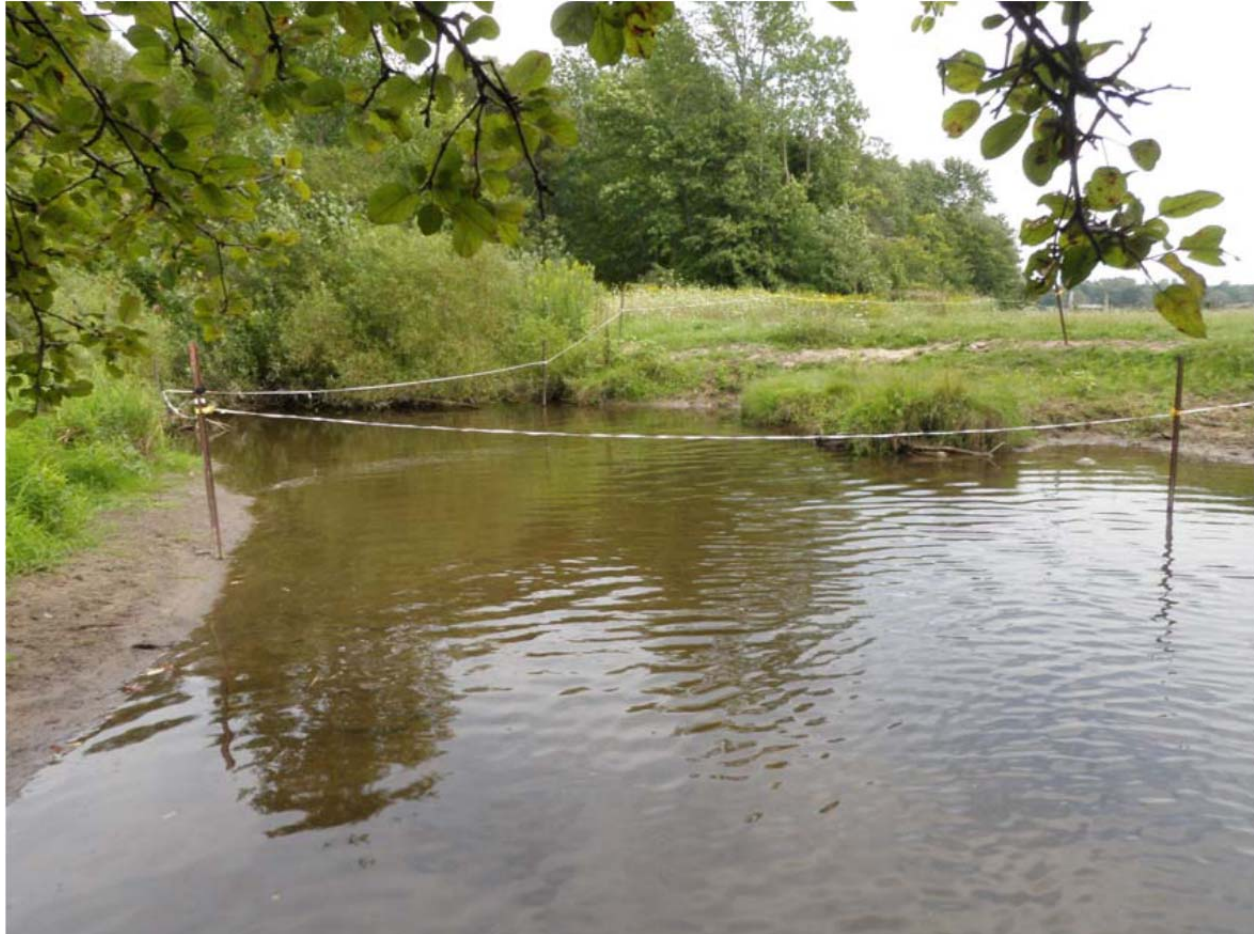
Figure 5. Photo of restricted, but direct access for horses in a section of North Branch Crockery Creek near 24th Avenue during 2009 survey.

At Station 16 the macroinvertebrate community scored acceptable (1; Table 4) and habitat scored good (119; Table 6). This site was sampled in 2009 and macroinvertebrates scored poor (-5) and habitat scored low good (106). In 2009, the macroinvertebrate community was dominated by Amphipoda and only one Ephemeroptera and one Trichoptera family were collected. In 2014, the macroinvertebrate community was still dominated by Amphipoda; however, three Ephemeroptera and three Trichoptera families were collected. The current results indicate moderate disturbance at the site, but the conditions may be improved since the last sampling event. During the 2009 survey, biologists observed that horses were allowed access to a section of the stream (Figure 5; Rippke, 2011).