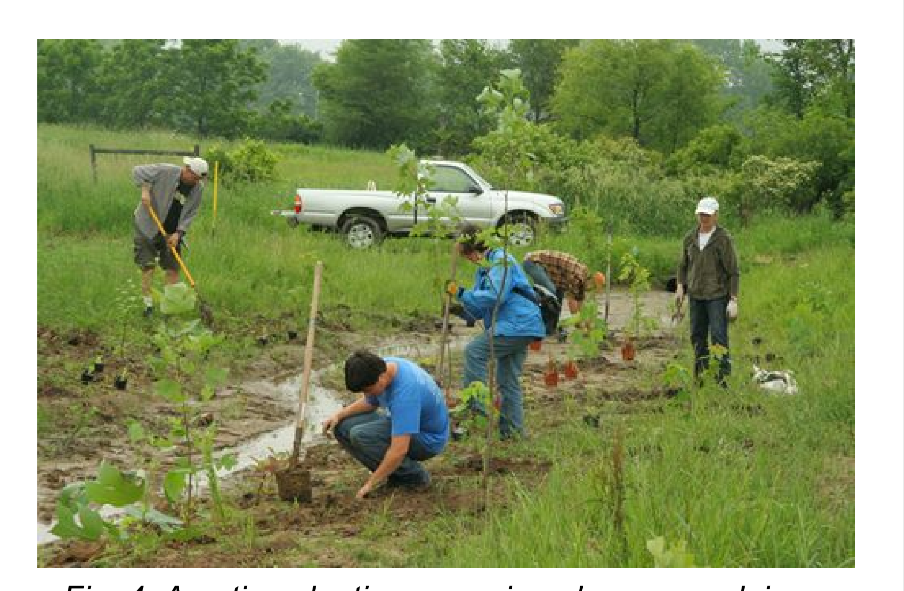
Fig. 4: A native planting occurring along a creek in the plaster creek watershed.

Plaster Creek Stewards will also do native plantings when requested. Plantings are often installed near Plaster Creek or its tributaries and which helps control erosion and sediment deposition into the creek. These plantings also help restore the natural biodiversity and previous landscape promoting native insects and mammals in the areas.