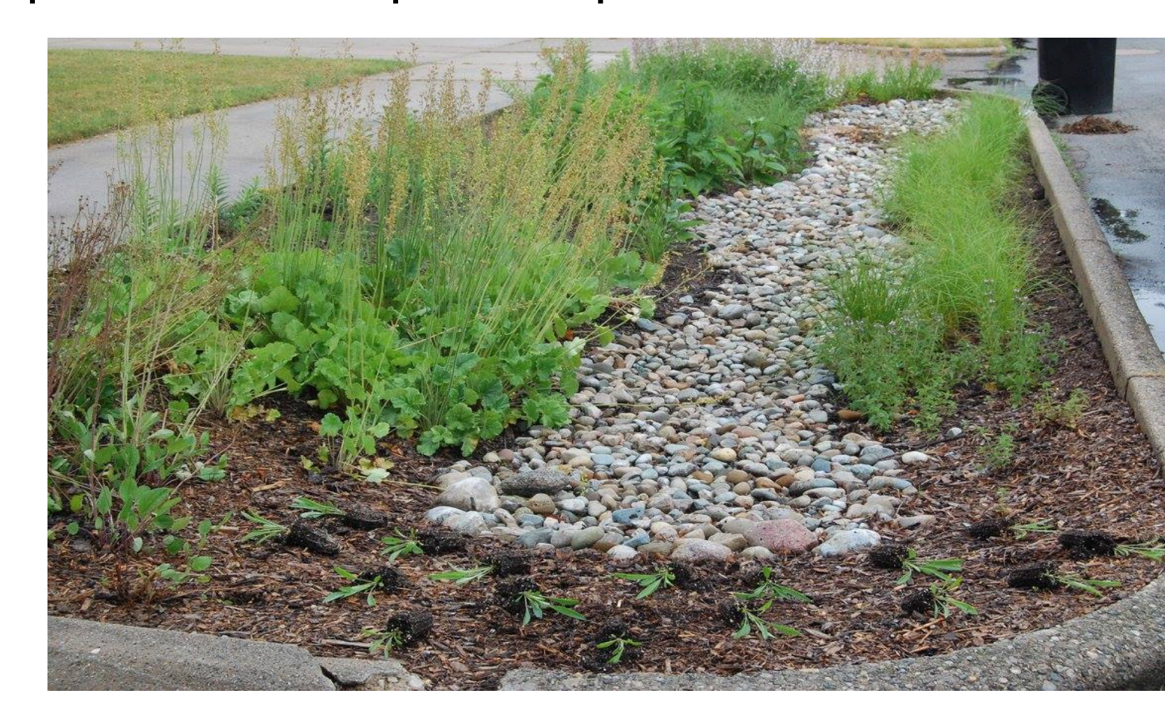
Fig. 1: A curb-cut rain garden installed by Plaster Creek Stewards. The rain garden consists of a rock channel with plantings around it

Plaster Creek Stewards use rain gardens to capture stormwater runoff and encourage a slow percolation of water into the ground. PCS focuses on the curb-cut rain garden. Stormwater runoff flows off of the streets and into the rock channel of a garden. Here, the rain water seeps into the garden and the plants and evaportranspirate the stormwater.