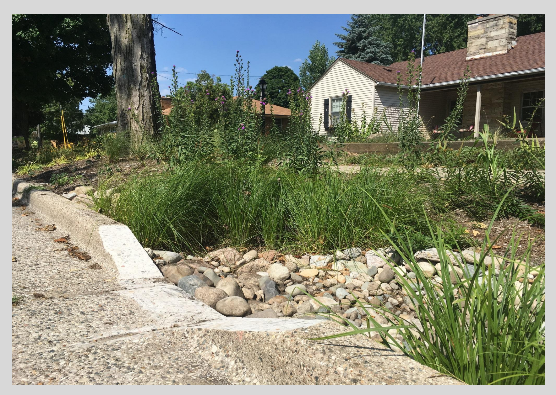
Figure 5: The cut curb of a mature rain garden in the Alger Heights neighborhood