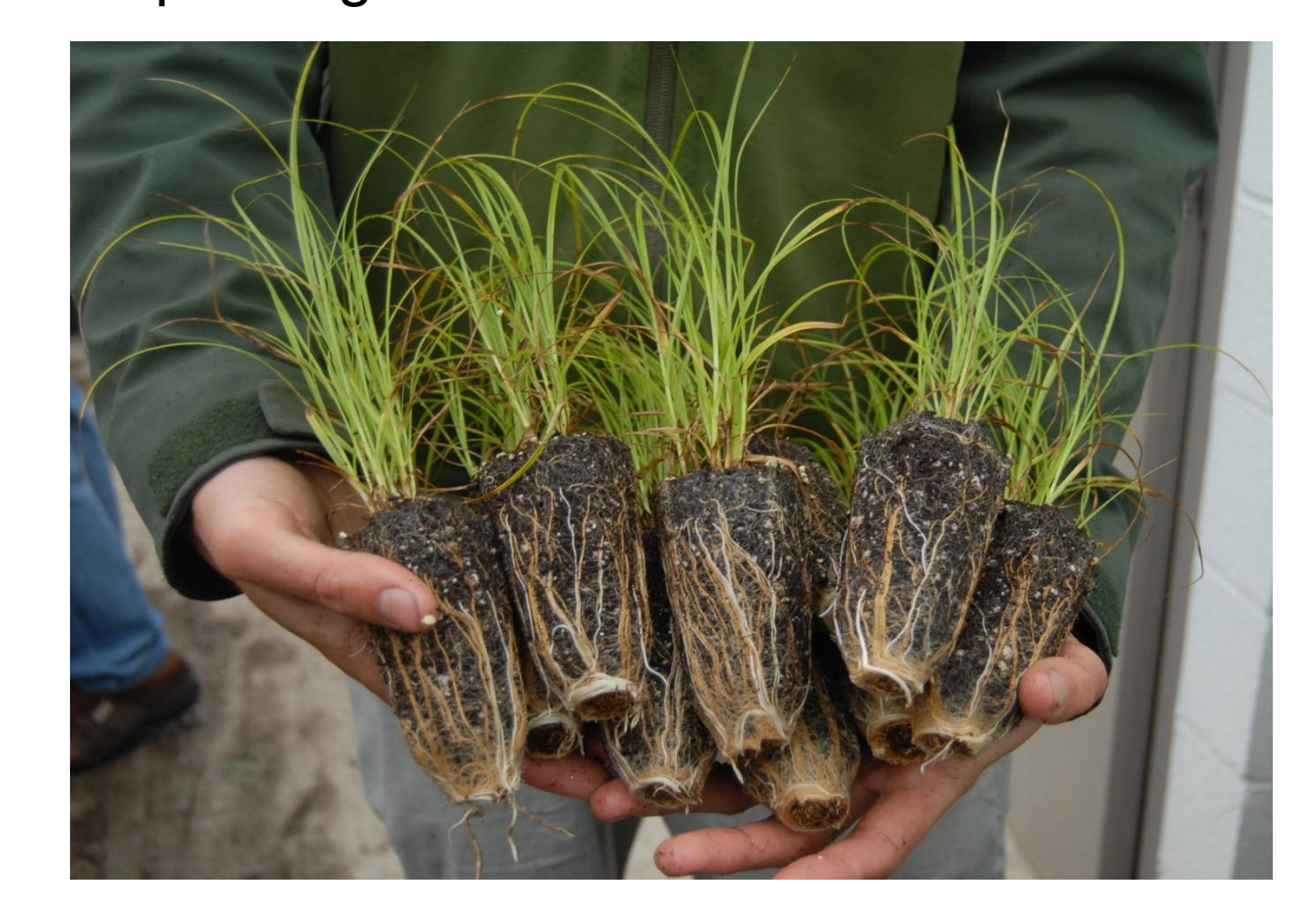
Fig. 2: A seedling of a native plant grown in the greenhouse. The roots of of many native plant species are extensive and help with the drainage of stormwater in the rain garden.

Native plants are used in all of our plantings and rain gardens because they are the best adapted to the Michigan climate and provide habitat for native wildlife. Plaster Creek Stewards collect seeds, propagate and grow as many native plants to populate our gardens and plantings.