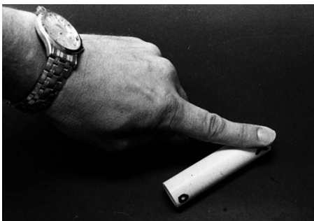
Fig. 2. The tube is launched by pressing down with an index finger and pulling back a little at one end. It will shoot forward about 0.5 m and then undergo a spin/rotation combination at that point. See the supplementary material for a video demonstration of the launch and the subsequent motion.

Equipment typically requested by students include a strobe light to “freeze” the motion; students can verify that both the X and O remain on the same side of the tube, and also that only the end of the tube opposite the launching end actually remains in contact with the surface. By using tubes of different lengths and/or diameters, students observe that a different number of symbols is seen for longer tubes and perhaps begin to notice the importance of a certain ratio of length to diameter if they measure the length and diameter with a ruler. By using a transparent tube, students will notice that both symbols are visible. This use, together with spinning the tube on a Plexiglas sheet, which shows that viewing from below allows the opposite symbol to appear, might lead them to determine an important symmetry of the situation. Markers of different colors can be used to explore the effect of placement of the symbol on the tube. A protractor might be used to measure the angle between the tube and the table