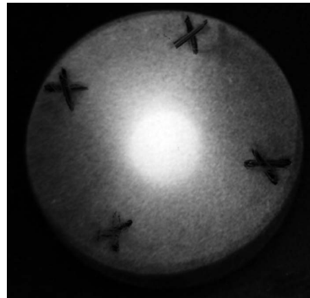
Fig. 3. A time exposure of spinning and rotating tube confirms what is seen by eye, namely, that only one out of the two symbols is visible. (The diameter of the circle in the figure is essentially the tube length.) This photograph results from launching the tube from the “X” end, as shown in Fig. 2.

(although this measurement will be useful only in an advanced analysis of the tube’s highest-speed motion). Rubber bands wrapped around one or both ends might help explore whether the friction is static or kinetic. Inserting some putty will change the location of the center of mass.