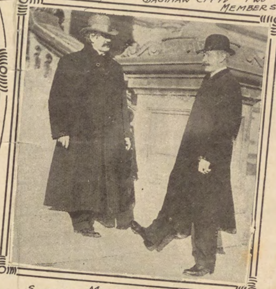
SENATOR MORIARITY, REPRESENTATIVE VANDERS