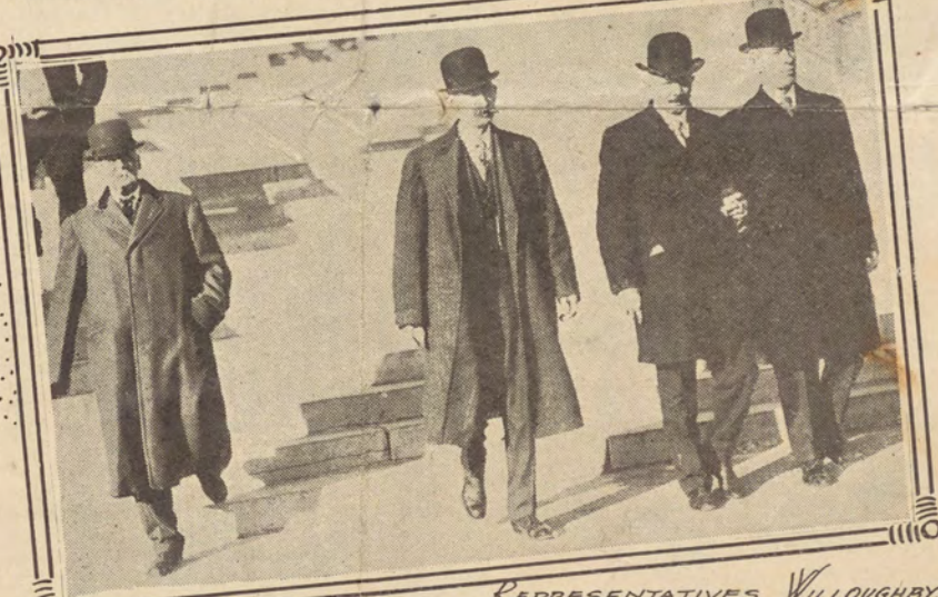
REPRESENTATIVES WILLOUGHBY, WOOD, MORRISON and McNAUGHTON