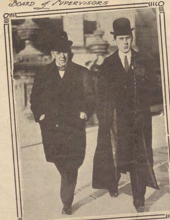
SENATOR NYHUT and REP. RICE