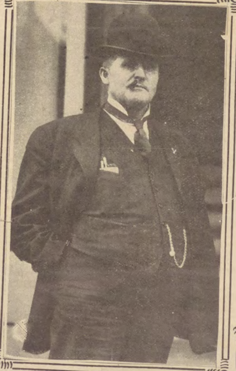
LABOR COMMISSIONER DICK FLETCHER